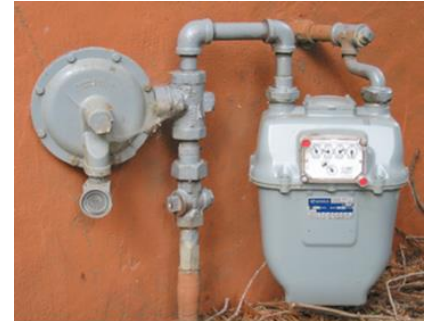
Single-unit residential meter